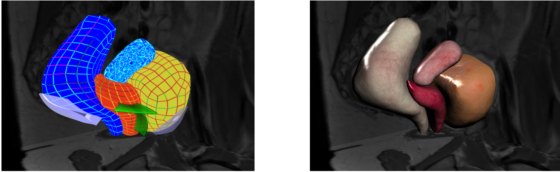
Figure 2: Model of the pelvis with (left) the finite element models of different anatomical structures and (right) their visual representations. Complex interactions take place between these deformable structures. The simulation is computed at interactive rates

numerical simulations. In one of our recent paper, we show that it is possible to teach a neural network from numerical simulations and predict , with good accuracy, the deformation of an organ .