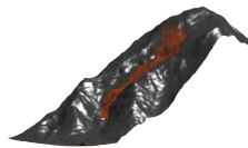
Figure 1. An example of avalanche simulation