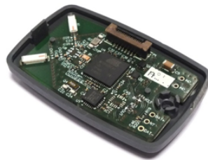
Figure 2. CAIRN's Zyggie platform for WBSN